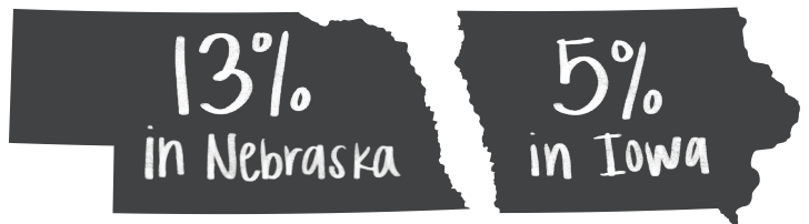
TOP 10 STATES BY NEW CSP CONTRACT ENROLLMENT, 2018