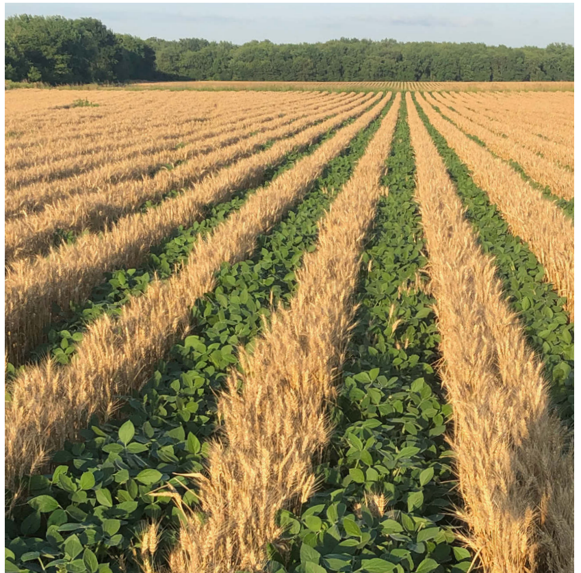
Relay cropping, an insurable option via written agreement, pictured in Iowa.

The option is available for soybeans relay cropped with winter wheat, as well as other small grains. To insure by this method, a producer must work with a crop insurance agent to submit a request for written agreement. Specific requirements will be determined by the producer's location in relation to NRCS cover crop termination deadlines. The second crop planted in a given year will require a written agreement. For example, if a wheat crop is followed by a soybean crop, the soybean crop will need a written agreement to be insured.