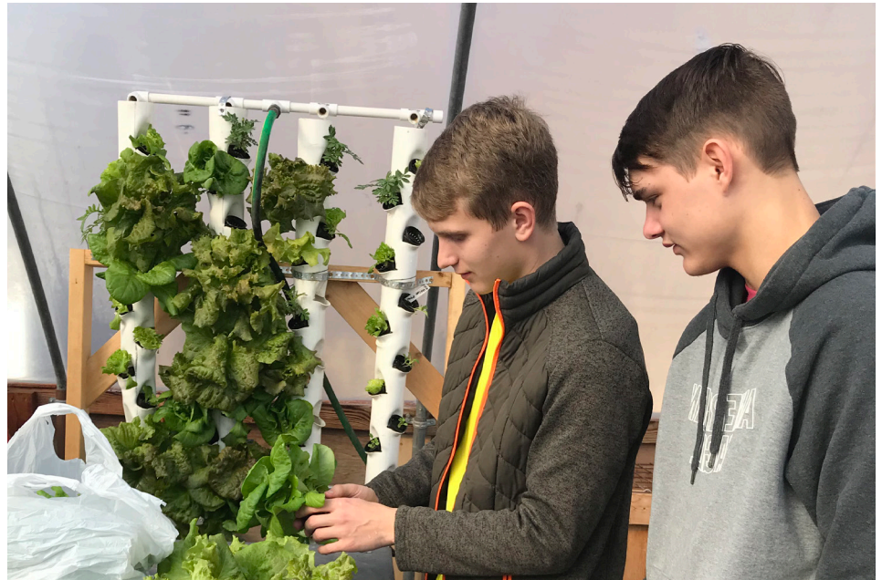
Students at Nebraska Christian Schools, in Central City, are the recipients of the first Greenhouse to Cafeteria award.

They grew tomatoes, cilantro, radishes, cucumbers, lettuce, green beans, a lemon tree, and pineapple plants. The students also used their hydroponics sys-