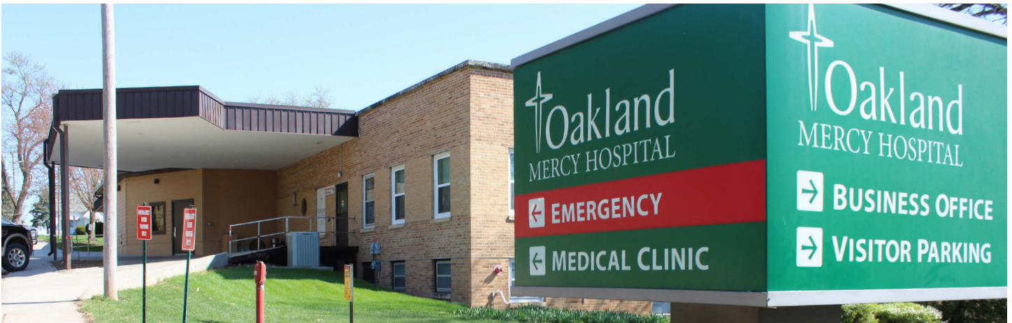
The hospital in Oakland, Nebraska, pictured here in April 2019, closed on July 1. The closure is part of a massive national trend. Since 2010, more than 120 rural hospitals have closed nationwide.